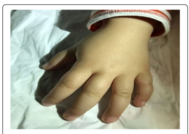
Fig. 2 Dysmorphic features of patient: large fleshy hands

growth factor-1(IGF-1) was 174 ng/ml (normal 55 \sim 327 ng/ml), and insulin-like growth factor binding protein-3 (IGFBP-3) was 5.07\,\mu g /ml (normal 0.7 \sim 3.6\,\mu g/ml ). Chinese version of GDS (Gesell Development Scale) was used as neuropsychological development examination, and Infant development was assessed using the development quotient (DQ) according to the following criteria: normal (DQ \geq 85 ), borderline ( 75 \leq DQ < 85 ) and abnormal (DQ < 75). The girl had DQ of 58 for "gross motor", 63 for "fine motor", 54 for "language", 57 for "adaptive behavior" and 66 for "personal-social". The results showed the girl had global developmental delay.