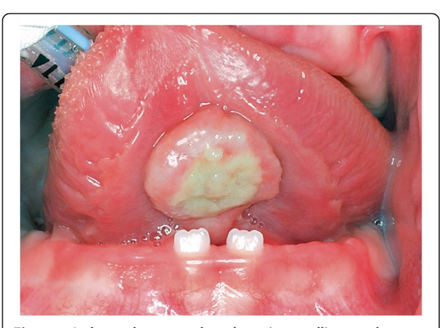
Figure 1 Indurated, non-tender, ulcerative swelling on the ventral surface of the tongue measuring 1.5 by 1.5 cm. Impressions of the primary lower central incisors were seen in the middle of the lesion.

Search. A summary of all these reported cases is shown in Table 1 [1-29].