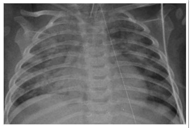
Figure 2 Chest X-ray of case 2.

The 3 patients described coincided in positive PCR for Influenza A virus (2 of them with co-infection with RSV), prolonged MV, ARDS with severe hypoxemia and